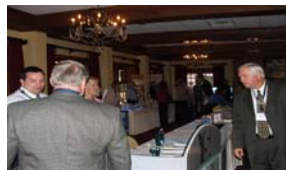
2007 Strategic Partners Display

Twenty-four of CCHA's strategic partners participated in the vendor fair at Alliance Day.