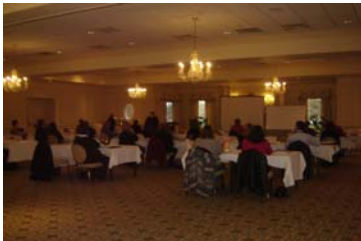
2008 Medicare Seminar

Training Seminar was a great success. There were 31 attendees and the meeting evaluations have been very positive!