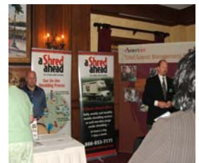
2007 Strategic Partners Display

Twenty-four of CCHA's strategic partners participated in the vendor fair at Alliance Day.